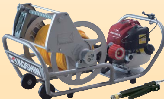
MS-ERH50 (ø6×50m Hose)